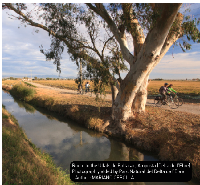
Route to the Ullals de Baltasar, Amposta (Delta de l'Ebre)

Visitors are well served by tourist information points and offices, including in both Protected Areas (Els Ports and the Ebro Delta), where they can find details on everything to do with the cycleways and related services.